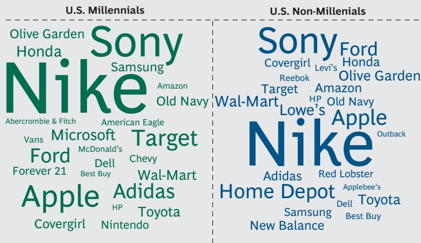
EXHIBIT 4 | Many Favorite Brands Are Shared by Both Generations

So what does all this mean for companies and their brands? For some, a fundamental reinvention may be in order. For instance, brands that target teenagers, college students, or young adults may have to be rethought for each successive generation. In other cases, companies may need to figure out how to introduce their brands to Millennials at the appropriate life stage. And for others still, reaching Millennials may simply require more relevant and resonant marketing messages. Some brands—such as Nike and Sony—are favorites among U.S. Millennials and non-Millennials alike and must try to remain so. Others, such as Target and Apple, appear to have a particular edge with Millennials. (See Exhibit 4.)